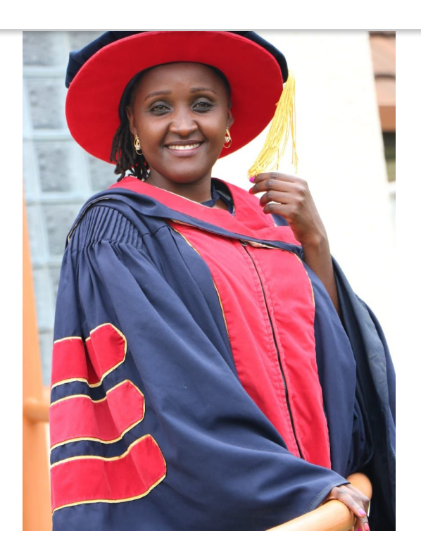
We have been working with organisations like DAAD and the African Academy of Sciences to learn from their vibrant alumni programmes. Stay tuned for Mawazo's own pilot alumni programme launching this September.